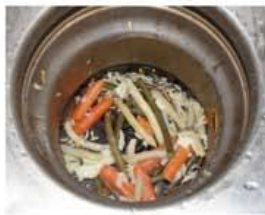
NOT CLEAR!! Needs to be run more!!