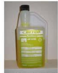
PH 7 for Cleaning Floors