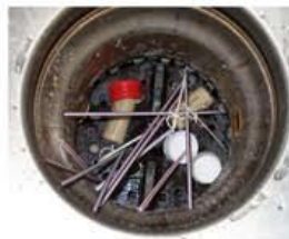
NOT ACCEPTABLE!!! Please Remove!!!