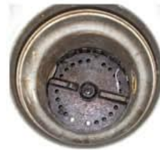
ACCEPTABLE!! Good to Go!